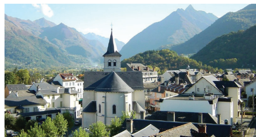
Left: Picturesque Argeles Gazost