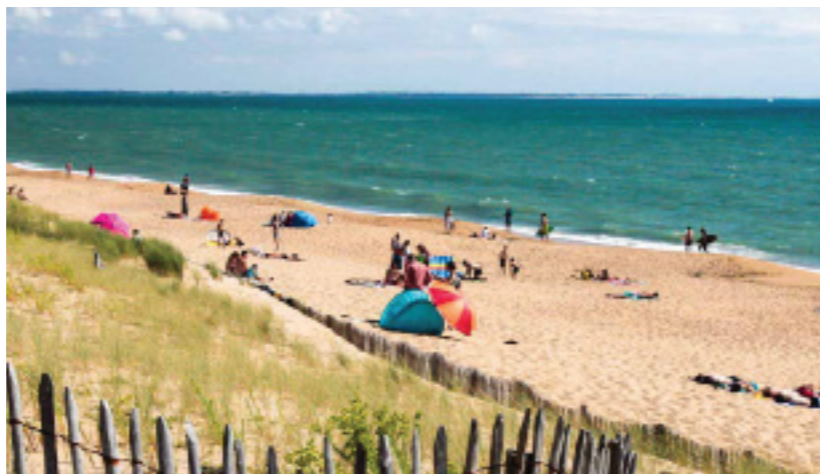
Above: Camping Baie D'Aunis with fabulous sea frontage

C amping Baie D'Aunis in La Tranche Sur Mer Map No. 6 (N46° 20' 46" W1° 25' 56") is one of our all time favourites being 400metres along the sea to a beautiful seaside town. It has a market on Tuesdays and Saturdays and the best cappuccinos in L'Equipe cafe and self service restaurant. Non ACSI, it's comparatively expensive and no dogs are allowed during July and August, but the location