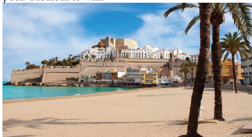
Left: Peniscola's Medieval town - view from beach

F rom here we usually head for Tarragona and Las Palmeras Map No. 9 (N41° 7' 49" E 1° 18' 43") Theoretically an ACSI site (2020 ACSI No 2871 ) but with a very short discount season, it's otherwise expensive, huge and can be extremely busy. It also has the main railway lines at the back of the site. On the plus side it has the best swimming facilities of any place we know outside of parts of the Greek Islands. It also has its own very convenient restaurant and a largish supermarket, plus it's about a 5km trip into the city of Tarragona which is a day's sightseeing by itself. A bike will help you get around this huge site which seems to be about a mile long, all of which connects directly to the sandy beach.