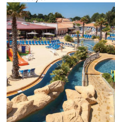
Above: Camping La Fief

would miss in high season when it can be too busy for us, but during the 3 weeks in a sunny September that it's still open, the swimming facilities, the cafe and bar are brilliant to laze away a few days.