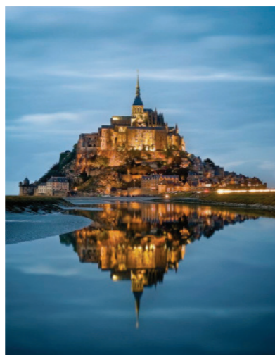
Above: Le Mont St Michel

motorway and just outside the tiny village of Courtils, which still had one cafe/bar in 2018. The site has a v. pleasant atmosphere and good facilities, including water fill by hose. Reception has a small bar and shop where you can sit overlooking the pool with one of their coffees!